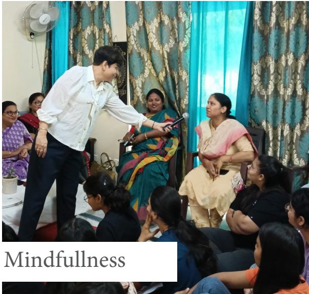
Lecture on Mindfulness