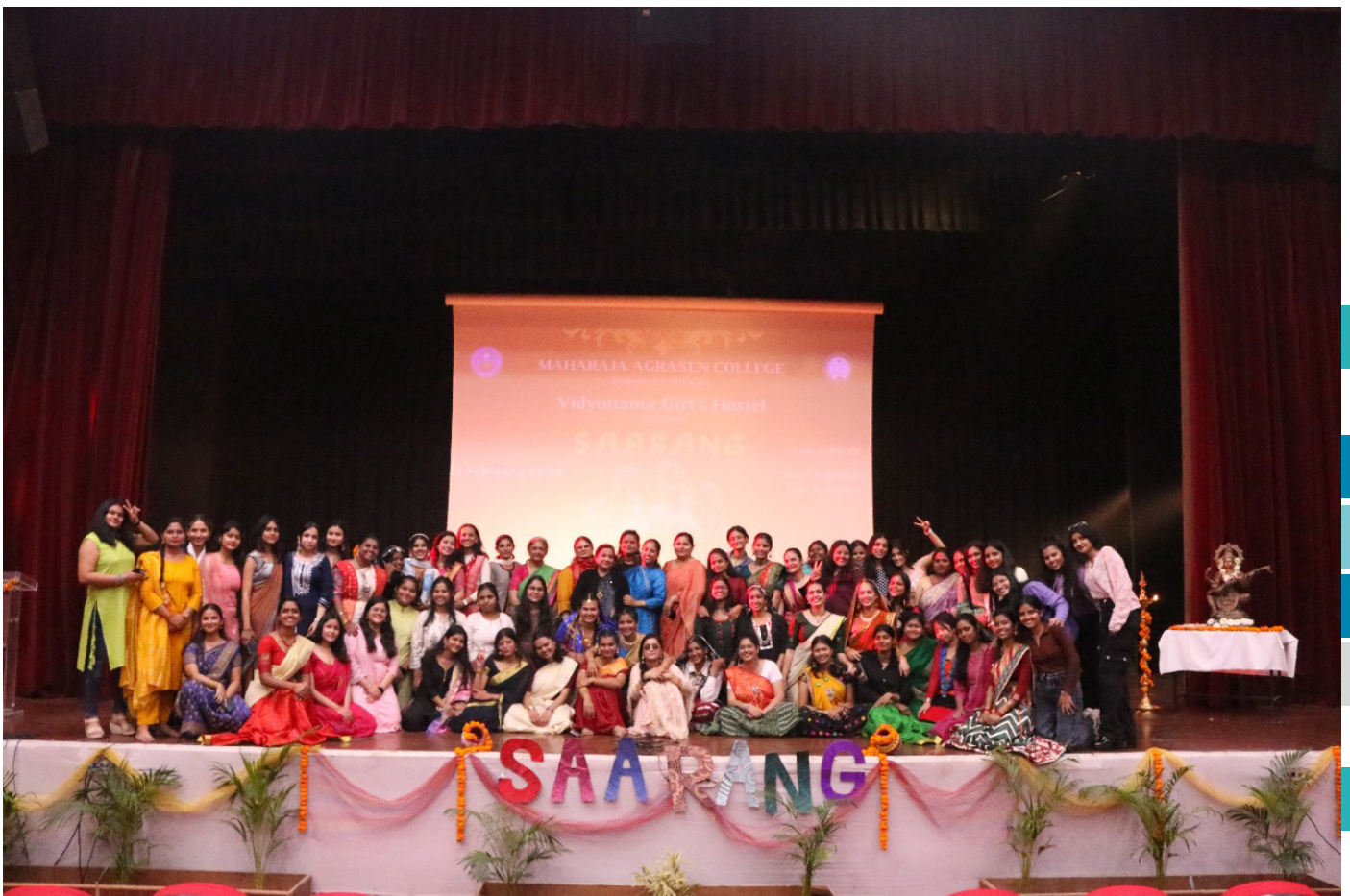
Residence of Vidyottama Girls' Hostel 2023-24