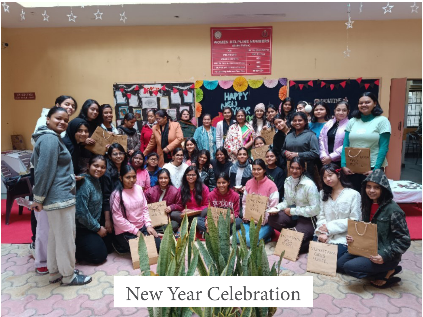
New Year Celebration